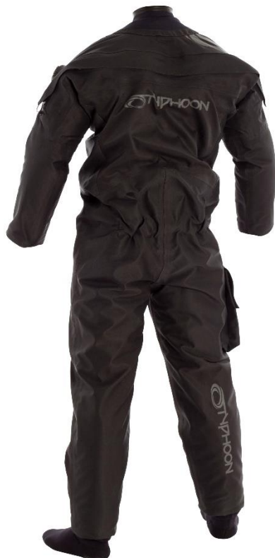
Back Entry Trilaminare Diving Drysuit