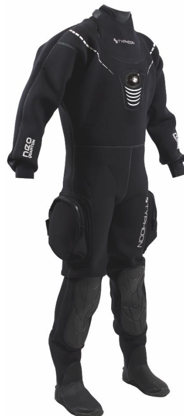
Back Entry Neoprene Diving Drysuit