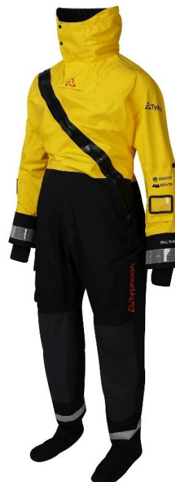
Model no. 130624 & 120220