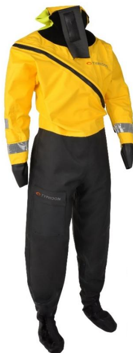
Model no. 120153